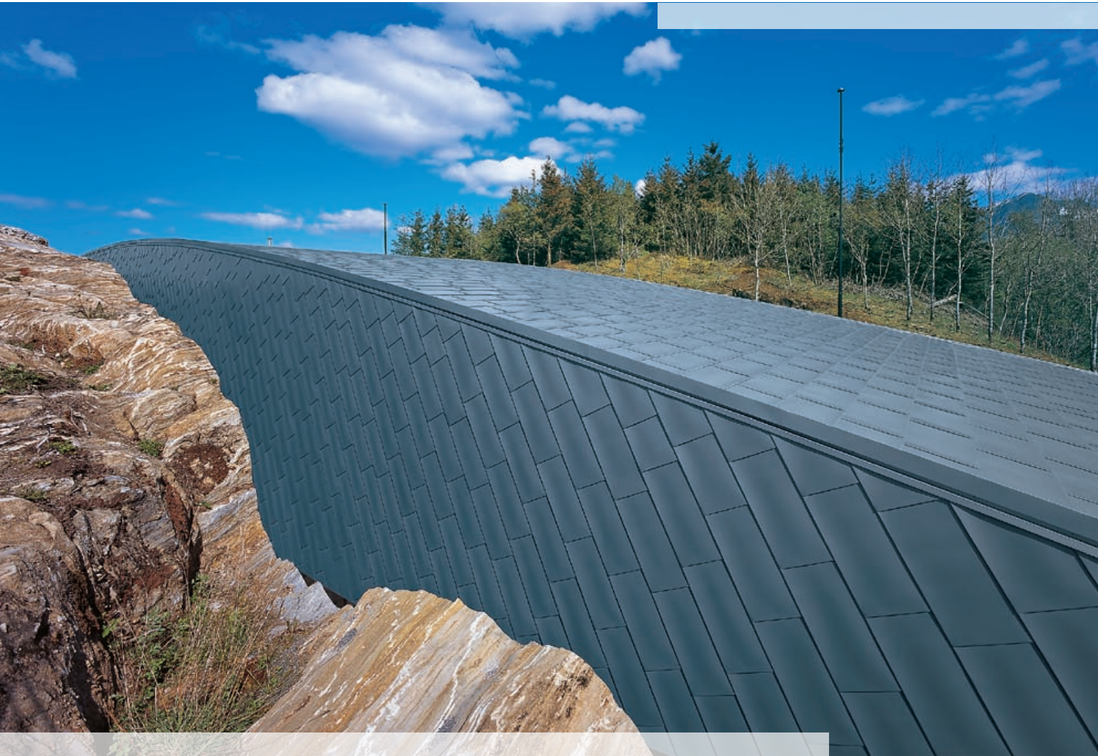
Petter Dass Museum, Sandnessjøen, Norway; Architect: Snøhetta, Oslo, Norway